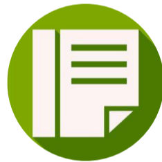
Registration of Dangerous Chemicals