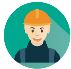
Business Safety Management