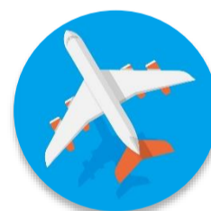
Overseas Customs Clearance